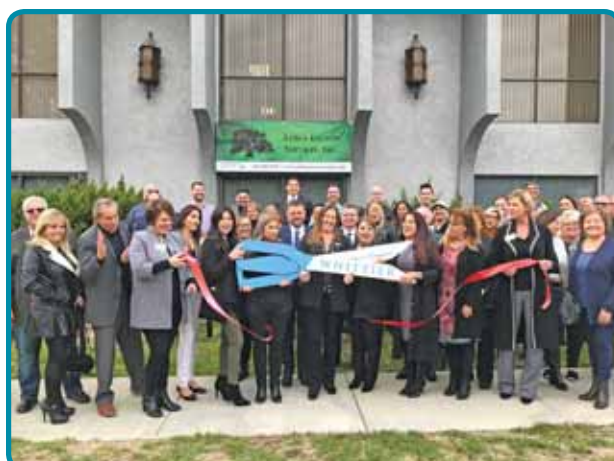
Arden Escrow Services, Inc. with Chamber members and friends, seconds after cutting the ribbon to celebrate the grand opening of their new location!