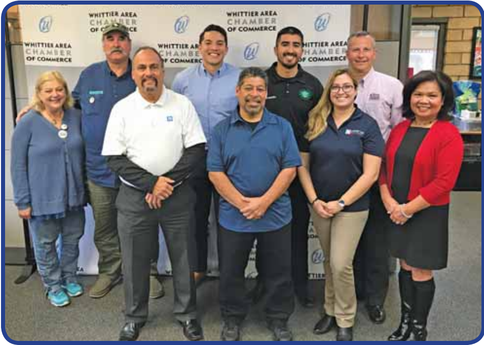
New members smile after learning what the Chamber does for their business at the New Member Orientation