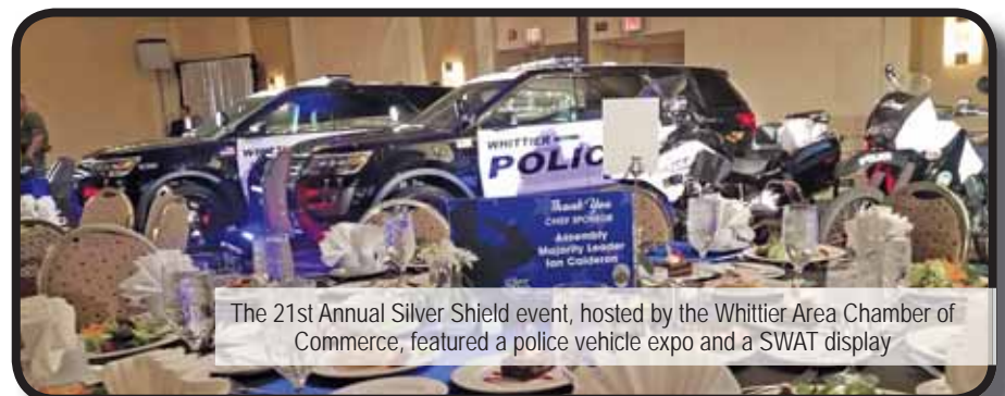
The 21st Annual Silver Shield event, hosted by the Whittier Area Chamber of Commerce, featured a police vehicle expo and a SWAT display