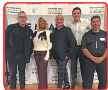
New members Reliant Urgent Care, Thrivent Financial, and HempWorx pose for a photo after being recognized at Wake Up Whittier