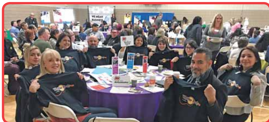
Table host Bluemoon Onstage showing off their Whittier Rocks t-shirts at Wake Up Whittier