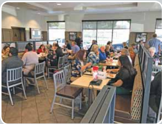
Tasty Tuesday guests enjoy lunch and networking before hearing about some upcoming events from fellow Chamber members

Thank you to Chick-Fil-A for hosting a great networking event!