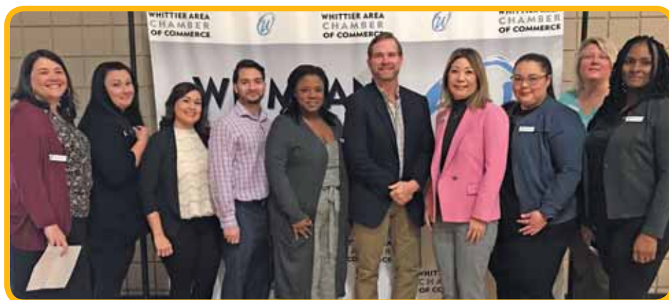
The fantastic YMCA of Greater Whittier staff getting ready to host Wake Up Whittier