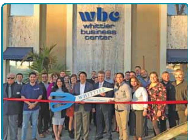
Whittier Business Center celebrates their grand opening with fellow Chamber and community members!