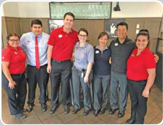
Chick-fil-A staff poses for a quick photo after serving over 35 hungry Chamber guests at January's Tasty Tuesday