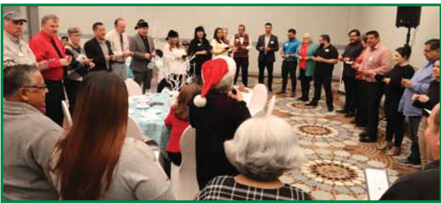
Holiday Luncheon Mixer attendees participate in a Holiday gift card exchange after a delicious meal and networking