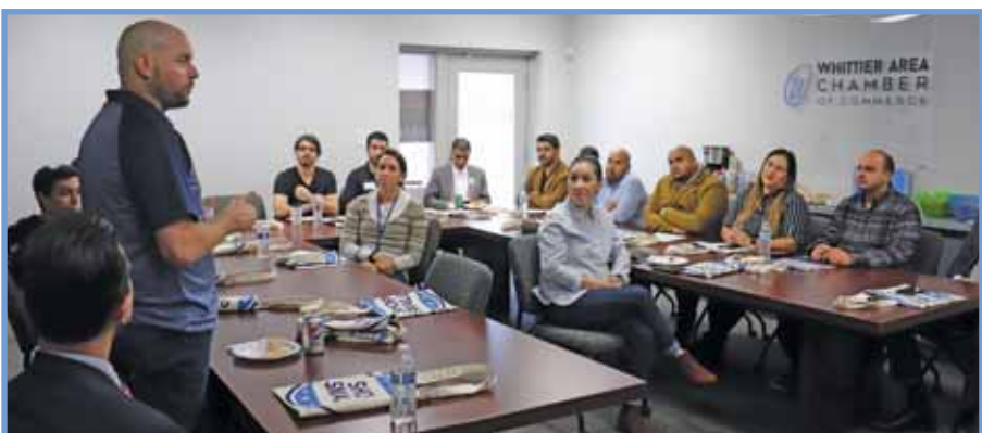
New and prospective members learn how to utilize Whittier Chamber membership