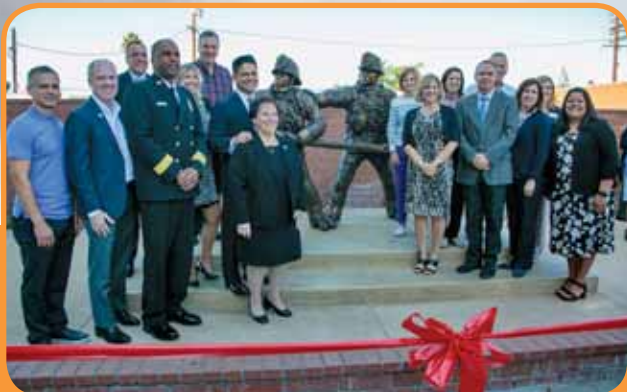
The Whittier Community Foundation Board of Directors

Crooked Gaff Kitchen is open Tuesdays – Thursdays from 3-10 p.m., Fridays and Saturdays 12-11 p.m., and Sundays 10 a.m.-3 p.m. including a special brunch menu. Visit them on Instagram (@cgk_2.0) and Facebook (@crookedgaff) for updates on menu items, new craft beers and special events.