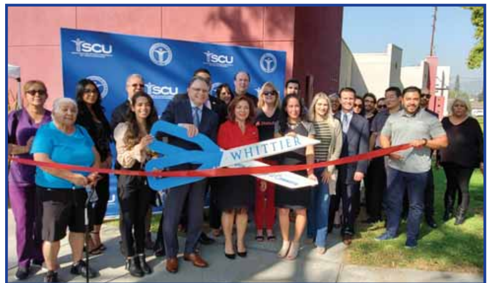
Southern California University of Health Sciences celebrates the grand opening of OUCH! Urgent Care with Congresswoman Linda Sanchez and a ribbon cutting