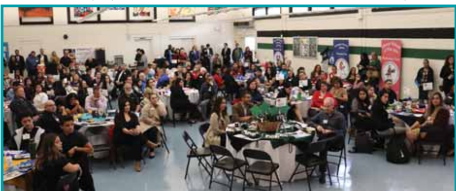
Over 160 business professionals attend the last Wake Up Whittier of 2019 at Dexter Middle School