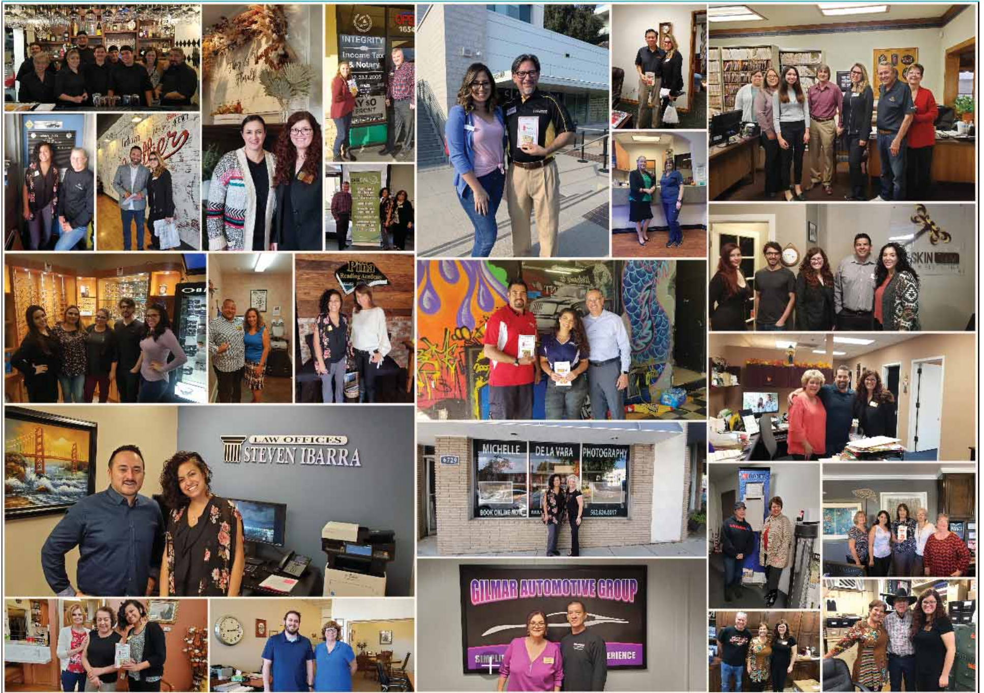
We LOVE our members! In celebration of Member November, we took a week to visit our members to show our appreciation! For more photos, visit bit.ly/MemberAppreciationWeek2019