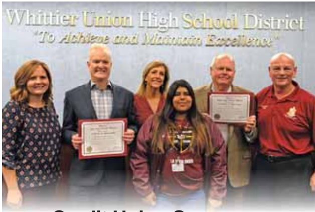
Whittier Union High School District "To Achieve and Maintain Excellence"