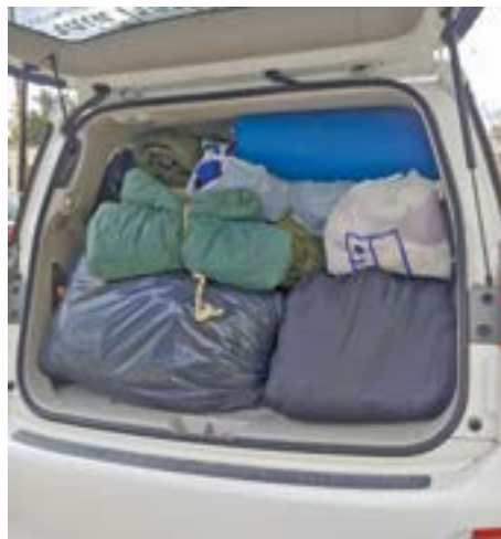
Rotary Club of Whittier filled van with warm clothing for earthquake victims.

With over 45,000 dead, Rotary had to step up to help. One van filled by one club may not seem like a lot but with the combined efforts of the 47 plus clubs within District 5320, we hope that we dented the relief efforts. Margaret Mead put it best when she wrote; "Never doubt that a small group